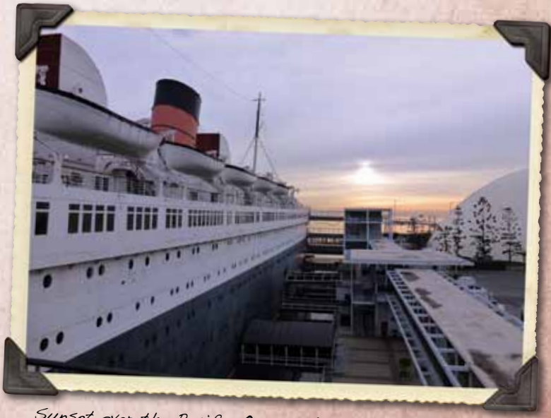
Sunset over the Pacific Ocean. Wish you were here!