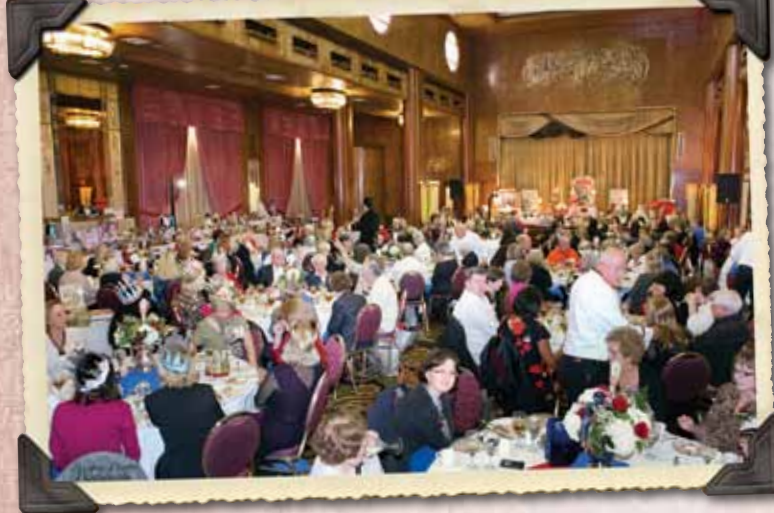
Oh, how beautiful the Queen's Salon looked, all decorated in patriotic red, white and blue! I was so proud as I looked out over the tables full of happy people, there to support our fundraiser.