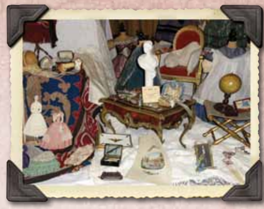
People have been quite generous to me in support of my charitable work! I am so very grateful for such bounty.