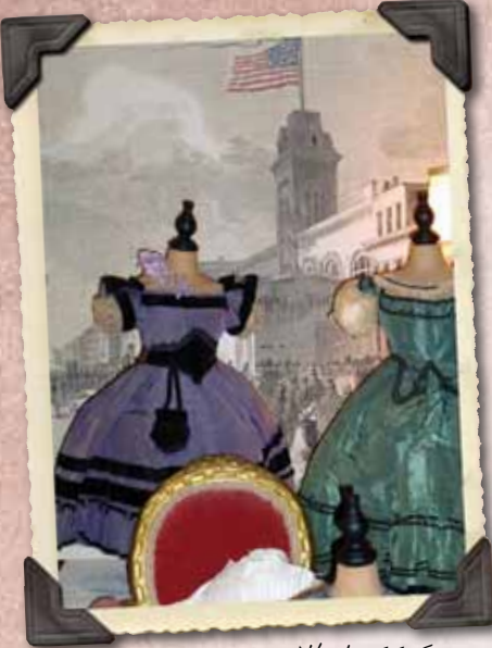
Two of my favorite silk dresses stand before a print of the New York Metropolitan Fair in April 1864, where I was first displayed with all my finery.